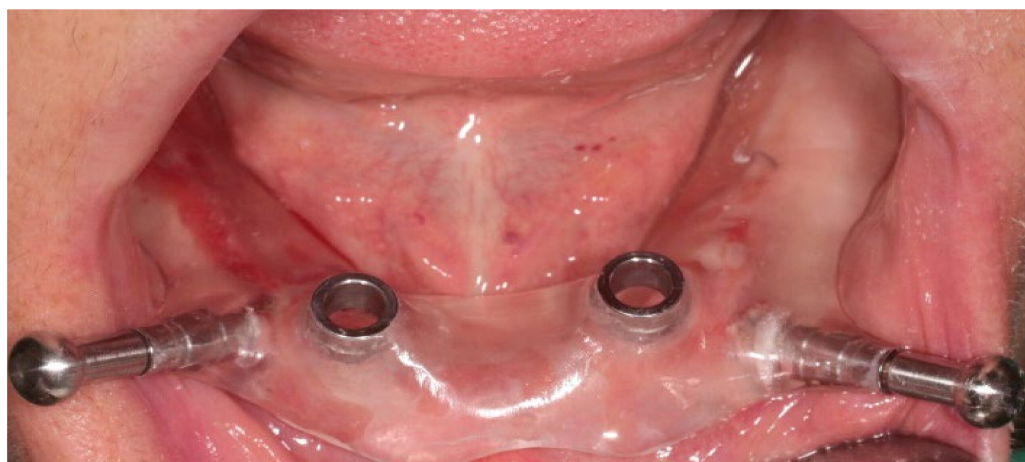
Figure 3. Placement of the surgical splint with the rings that allow the insertion of the implants through a flapless approach.