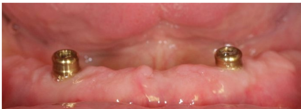
Figure 4. Clinical appearance after placement of prosthetic attachments.

Existing dentures were molded and relined with soft material to not interfere with the peri-implant tissues and reduce occlusal forces on the implants. After six weeks of surgery, early loading was performed. An open impression technique with individualized tray and addition silicone material was used. An Overdent ® (Galimplant, Sarria, Spain) attachment system was used in the manufactured and retention of the overdentures over the osseointegrated implants. (Figures 4 and 5).