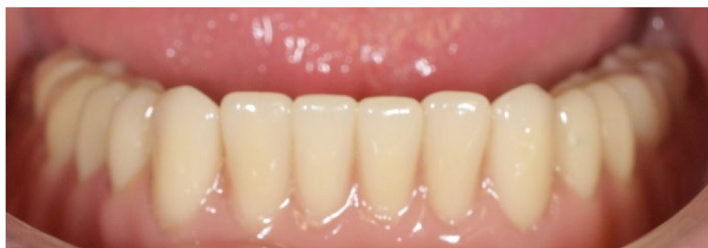
Figure 5. Inserted prosthesis.

Implant stability and absence of peri-implant radiolucency, mucosal suppuration, and pain were considered as survival criteria. All patients were included in a maintenance program consisting of clinical and radiological examination and cleaning of prostheses and implants. The frequency of revisions was set at 3 and 6 months and annually after guided implant insertion. Periapical radiographs acquired digitally using positioners were used to measure follow-up in marginal bone loss. The analyzed variables included patient information (gender, age, dental health, systemic diseases, history of periodontitis, smoking habit), details about the placed implants (type, number, position, diameter, and length), and the implant-supported overdenture including the dates of delivery. In addition, surgical, biological, and technical complications that occurred during implant insertion, postoperatively, or during function in the follow-up period, were recorded.