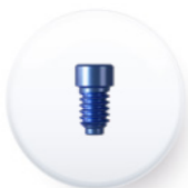
Ref. TMU 4048

The recommended insertion torque is 30 Ncm.