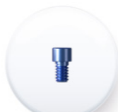
Ref. TMUT 40

The recommended insertion torque is 10 Ncm.