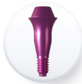
Aesthetic straight multi-position M2 abutment