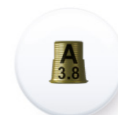
Ref. PITEMUA DA4040