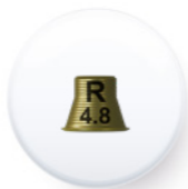
Ref. PITEMUR DA5040