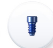
Ref. TMU 4048