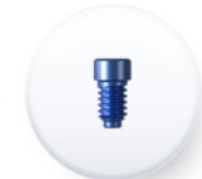
Ref. TMU 4048