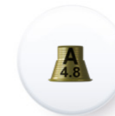
Ref. PITEMUA DA5040