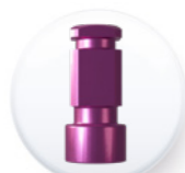
Ref. AIPTR 50