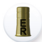
Ref. PITEMUR DAE4075

The interfaces can be acquired in package that contains an interface and two TMU 4048 screws, one clinical and the other for the laboratory.