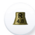
Ref. PITEMUR DA5040