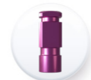
Ref. AIPTR 40