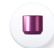
Ref. EPCTR 4844