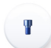
Ref. TMUT 40