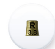
Ref. PITEMUR DA4040