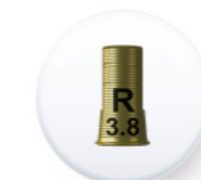
Ref. PITEMUR DA4075