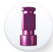
Ref. AIPTR 50