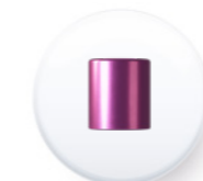
Ref. EPCTR 4044