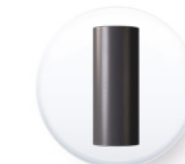
Ref. SBT MUSR