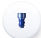
Ref. TMU 4048