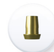
Ref. PCERCMA 40