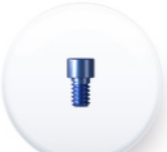
Ref. TMUT 40