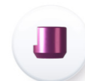
Ref. EPCTA 4844