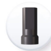
Ref. SBT MUS 50