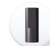
Ref. SBT MUSA