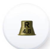
Ref. PITEMUR DA5040