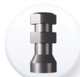
Ref. AIPMU 40