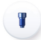
Ref. TMU 4048