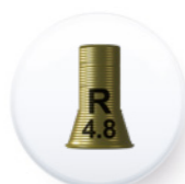
Ref. PITEMUR DA5075