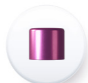
Ref. EPCTR 5044