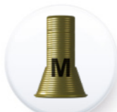
Ref. PITEMUTR DA4075