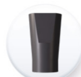
Ref. SBT MUST