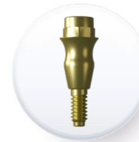
Multi-unit Aesthetic slim straight abutment