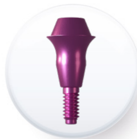
Multi-unit Aesthetic wide straight abutment