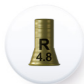
Ref. PITEMUR DA5075

The interfaces can be acquired in package that contains an interface and two TMU 4048 screws, one clinical and the other for the laboratory.