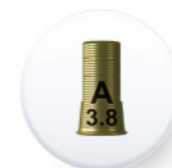
Ref. PITEMUA DA4075