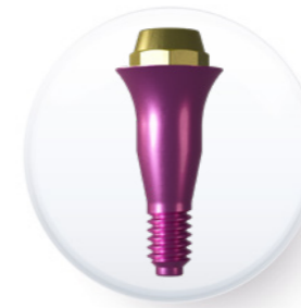
Aesthetic straight multi-position M2 abutment