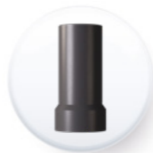
Ref. SBT MUSR 50