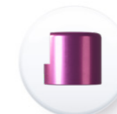
Ref. EPCTA 5044