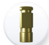
Ref. AIPT 40