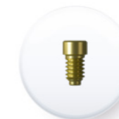
Ref. TPIA DP4048

The recommended insertion torque is 30 Ncm.