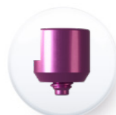
Ref. EPCTEA 4844