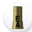
Ref. PITEMUR DAE5040