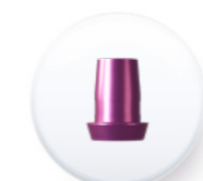
Ref. PCERC MUR 40

The interfaces can be acquired in package that contains an interface and two TMU 4048 screws, one clinical and the other for the laboratory.