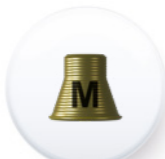
Ref. PITEMUTR DA4040