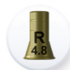
Ref. PITEMUR DA5075

The interfaces can be acquired in package that contains an interface and two TMU 4048 screws, one clinical and the other for the laboratory.