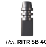
Ref. RITR SB 40