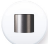
Ref. PCM 4830