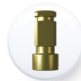
Ref. AIPT 50