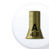
Ref. PITEMUA DA5075

The interfaces can be acquired in package that contains an interface and two TMU 4048 screws, one clinical and the other for the laboratory.