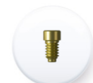
Ref. TPIA DP4048

The recommended insertion torque is 30 Ncm.